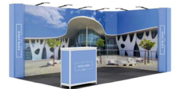
imagen ejemplo / example